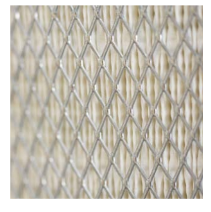
With its DST filter, the RecondOil Box also removes both soluble and insoluble varnish, thereby avoiding clogged systems. Varnish removal also offers cooler operational temperature and longer component and oil life.