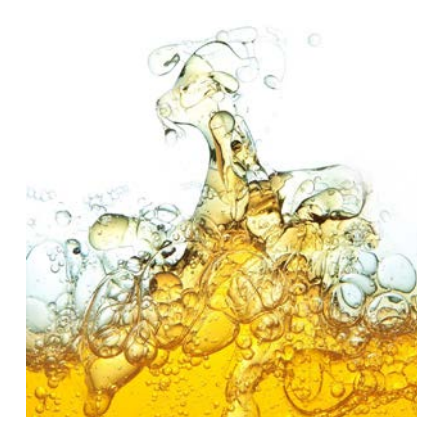
In addition, the RecondOil Box is also efficient at water removal, and can remove dissolved, emulsified and free water out of an oil.